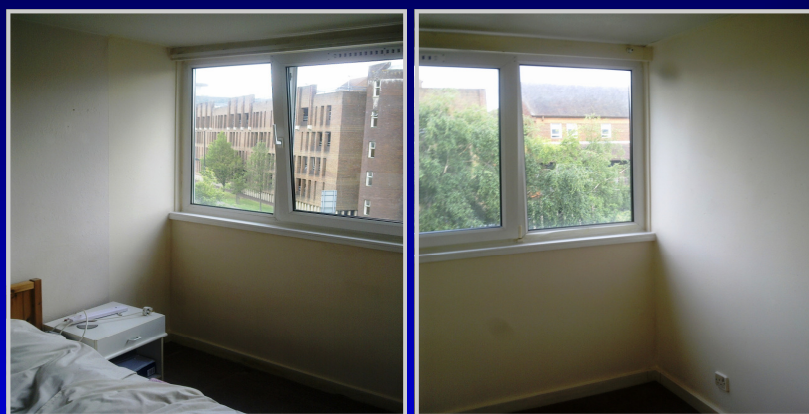
Wallpaper, window sills & Frame, stripped down & mould treated + full repair + Dulux Paint decoration

As Specialists in UK Property Services , a FULL interior Re Decoration is also highly recommended, on a 3-5 yearly basis for most UK properties , seen as good ongoing UK standard industry practice , especially in residential UK lettings sector . ESO agents now offer 3 main options for FULL re decorating interior services , with a range of extra PROTECTIVE & DURABLE long term finishes built in.