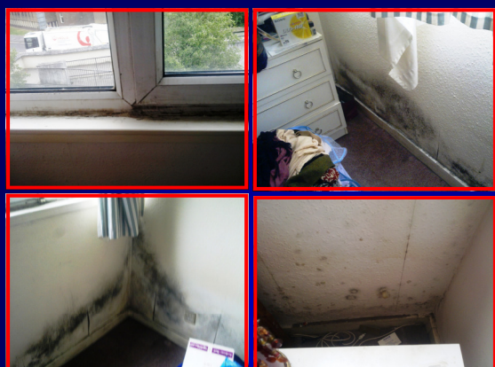
Wallpaper Condensation & Mould Damage In 2 bedrooms, on walls, in window Alcove